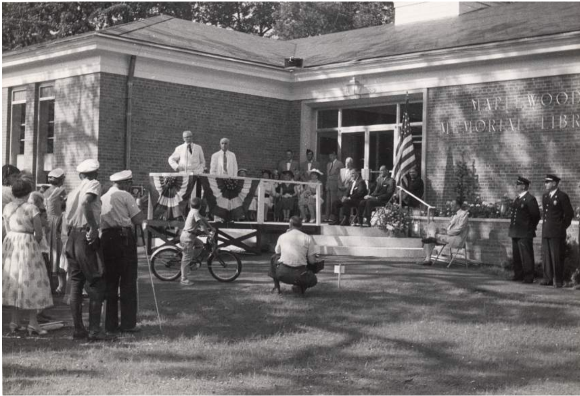
The Main Library Dedication Ceremony in 1956.