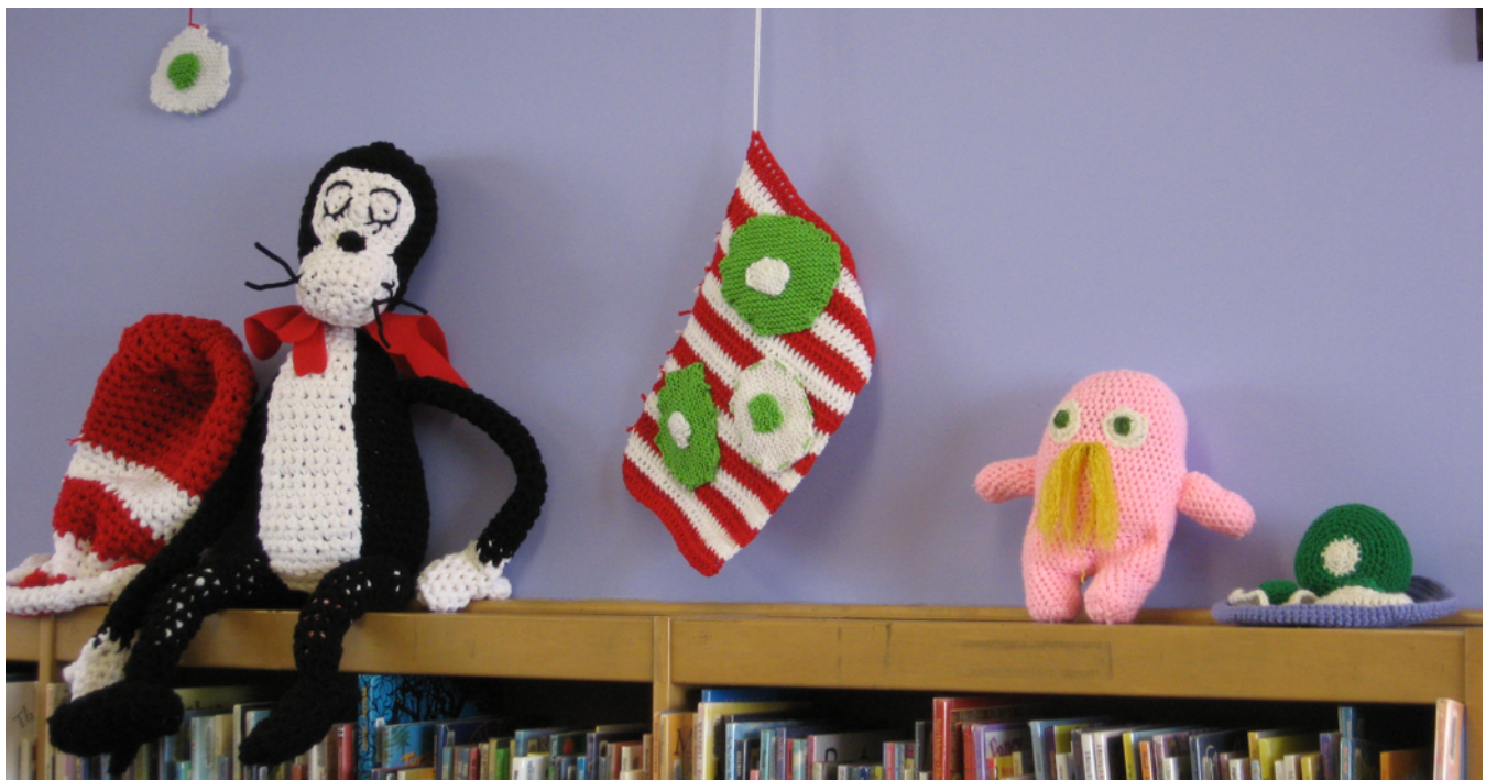
Yarnbombing of The Cat in the Hat, The Lorax, and Green Eggs and Ham at Hilton Branch in honor of Dr. Seuss’ birthday in March