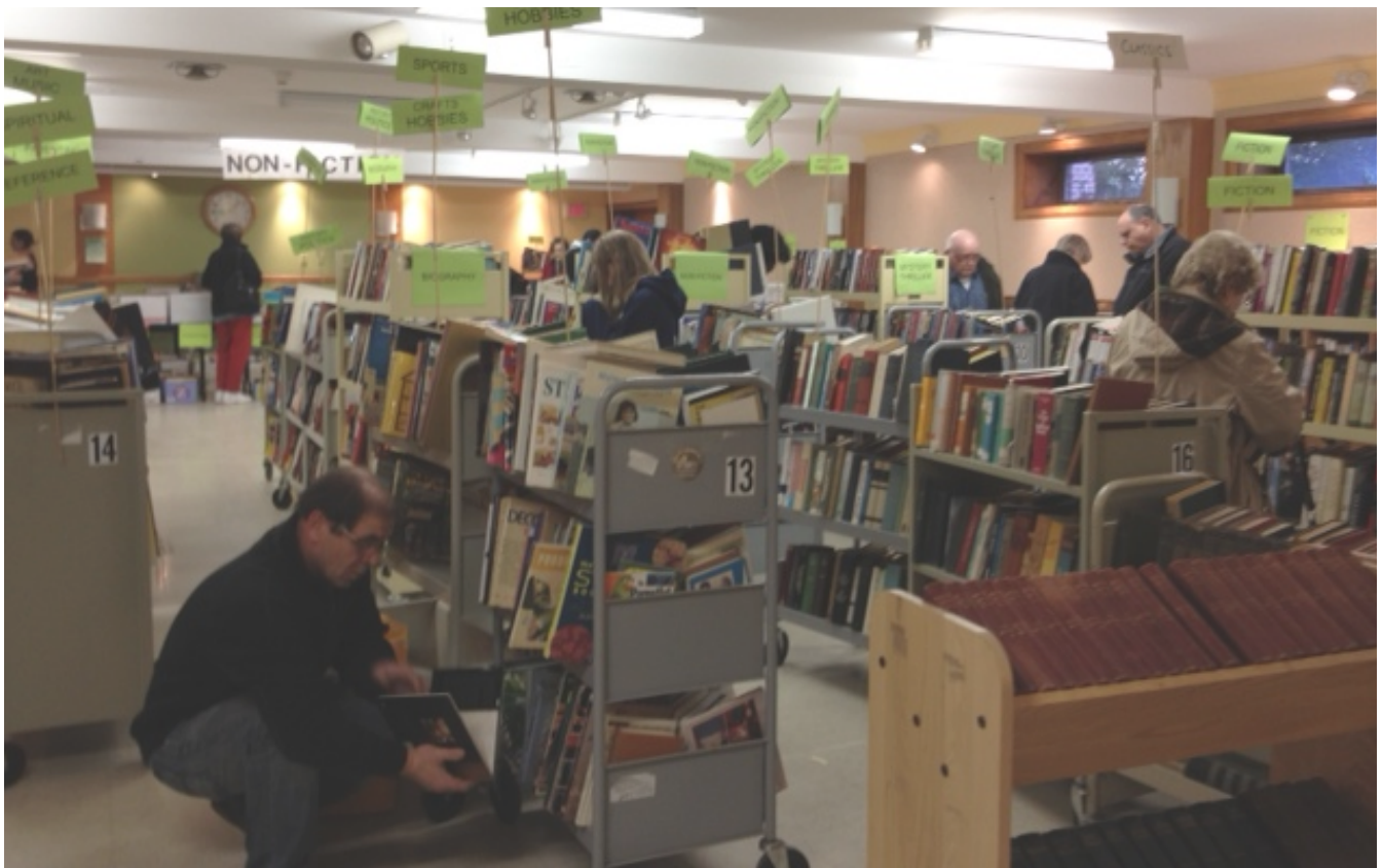
A scene from our most recent booksale